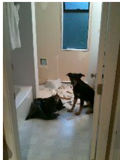
Our helpers Louis & Lucy

Here's the inside scoop of how we worked together as a DIY (do-it-yourself) team to update our bathroom with a budget of $1,000 (not much!)