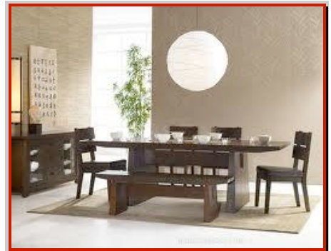
Area rug used to define a dining area.

If, however, your furniture grouping is floating in the space, then I suggest the rug be large enough to be placed fully under all the furniture legs.